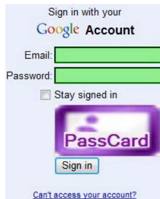
Fig. 3. PassCard logo